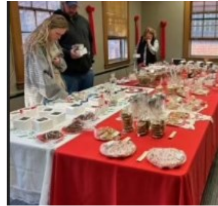
GFWC Rhinelander Woman's Club led ArtStart's Holiday Market bake sale with holiday treats and goodies.