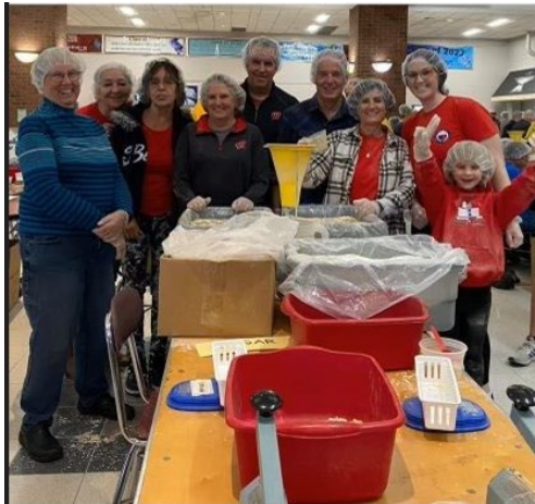
Lakeland Area GFWC Women’s Club members (and boosters) help package food as part of the Food for Kidz event in Minocqua as part of the GFWC Foodsgiving event. Food goes to local and regional food pantries for those with food insecurity.