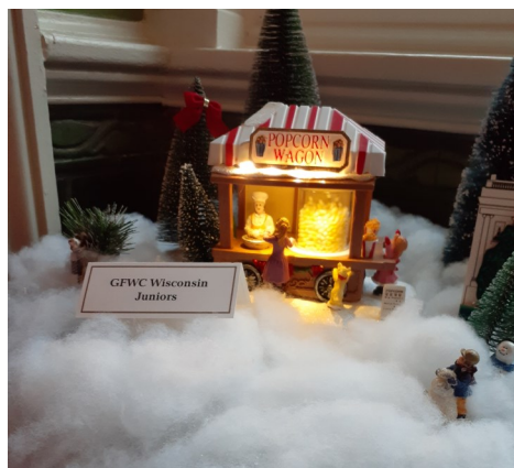
GFWC-WI Juniors Popcorn Wagon