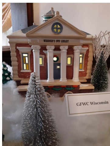
Wisconsin's Own Library

Every room was aglow with holiday decorations, smiling faces and cheerful conversation. It was a wonderful experience.