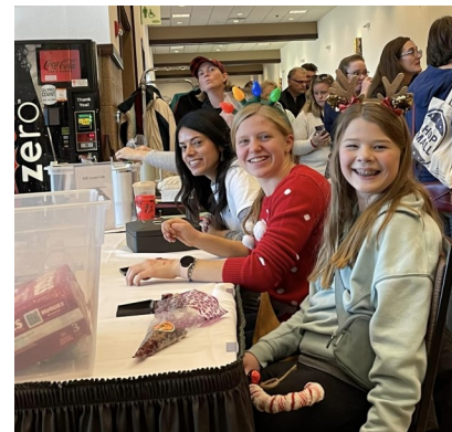
The Stevens Point Junior Woman's Club successfully hosted the Tinsel Trail event on November 19, 2023.