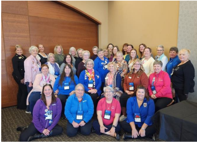
Junior Fall Conference Attendees