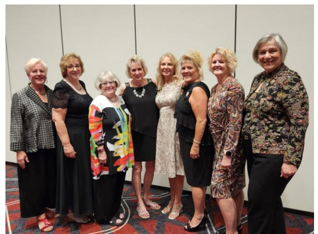
Great Lakes Region State Presidents and Directors of Junior Clubs known as the Great 8.