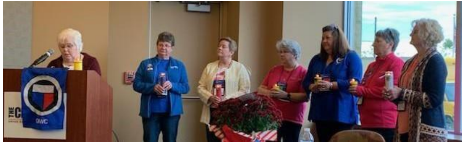
Chartering of GFWC WI Past State Directors of Junior Clubs