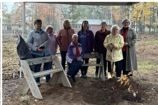
Group shot of GFWC-WI members after the tree planted